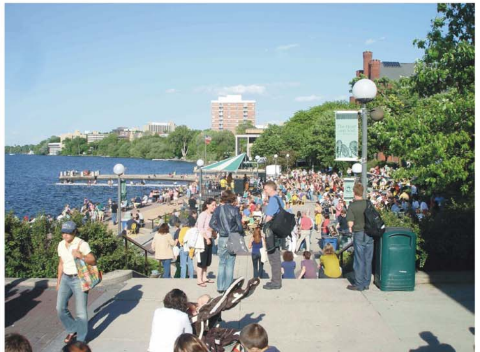
Scenes from RNA 2009